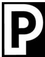
White outer P, black inner P (“Logo 1”) (the black background shown above is not part of the logo, but is for illustrative purposes here only)

1.121 Two versions of the universal logo 8