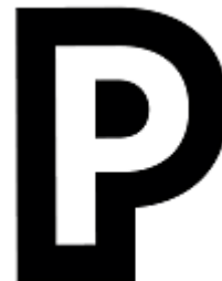
Black outer P, white inner P (“Logo 2”)