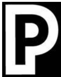
White outer P, black inner P (“Logo 1”) (the black background shown above is not part of the logo, but is for illustrative purposes here only)