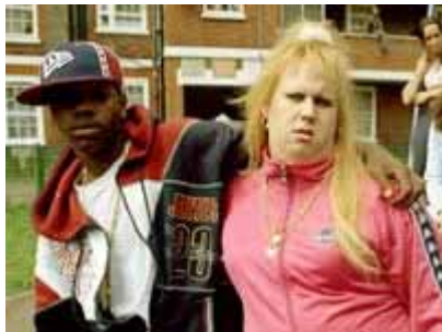
Little Britain (BBC)