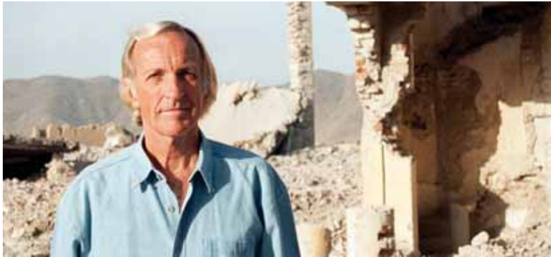
Breaking The Silence: The Truth About the War on Terror (ITV1)